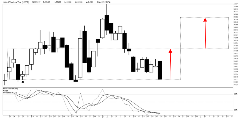
Kinerja saham UNTR

Danareksa research report are also available at Reuters Multex and First Call Direct and Bloomberg